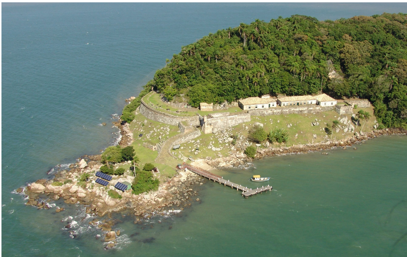
Fortaleza de Santo Antônio de Ratones

In the bay north of Santa Catarina Island is the small outcrop of Ratões Grande – and the reason you come here is to admire this fortress. Built by the Portuguese in the 18th century to uphold the occupation of southern Brazil, it did time as a quarantine station for maritime voyagers. After centuries left to the forest's slow embrace, renovation projects have made it fascinating for a day trip today. Come and wander the eerily quiet, gently crumbling structures made of island granite, keeping your eyes peeled for aged cannons.