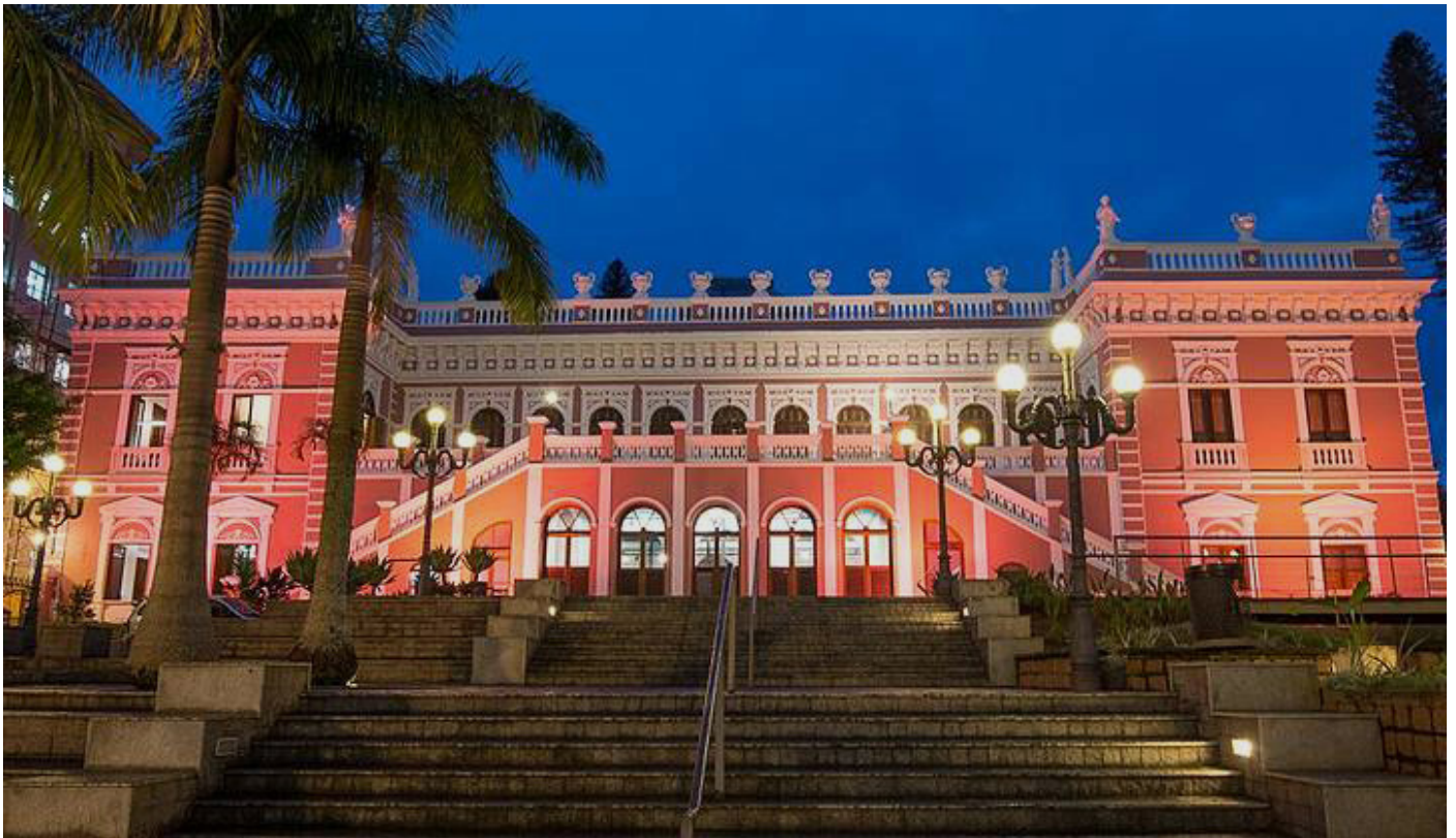
Santa Catarina History Museum

At the heart of Santa Catarina island, the main attraction is a series of salt-water lakes. With almost no waves, they're the business for wind- and kite-surfing and the surrounding mountains have a series of launch ramps for paragliding. A flight over the beaches and rainforests, dropping low over the lagoons, is spectacular, with a handful of local clubs offering tandem flights suitable for all ages, as well as classes leading to full paraglide certification.