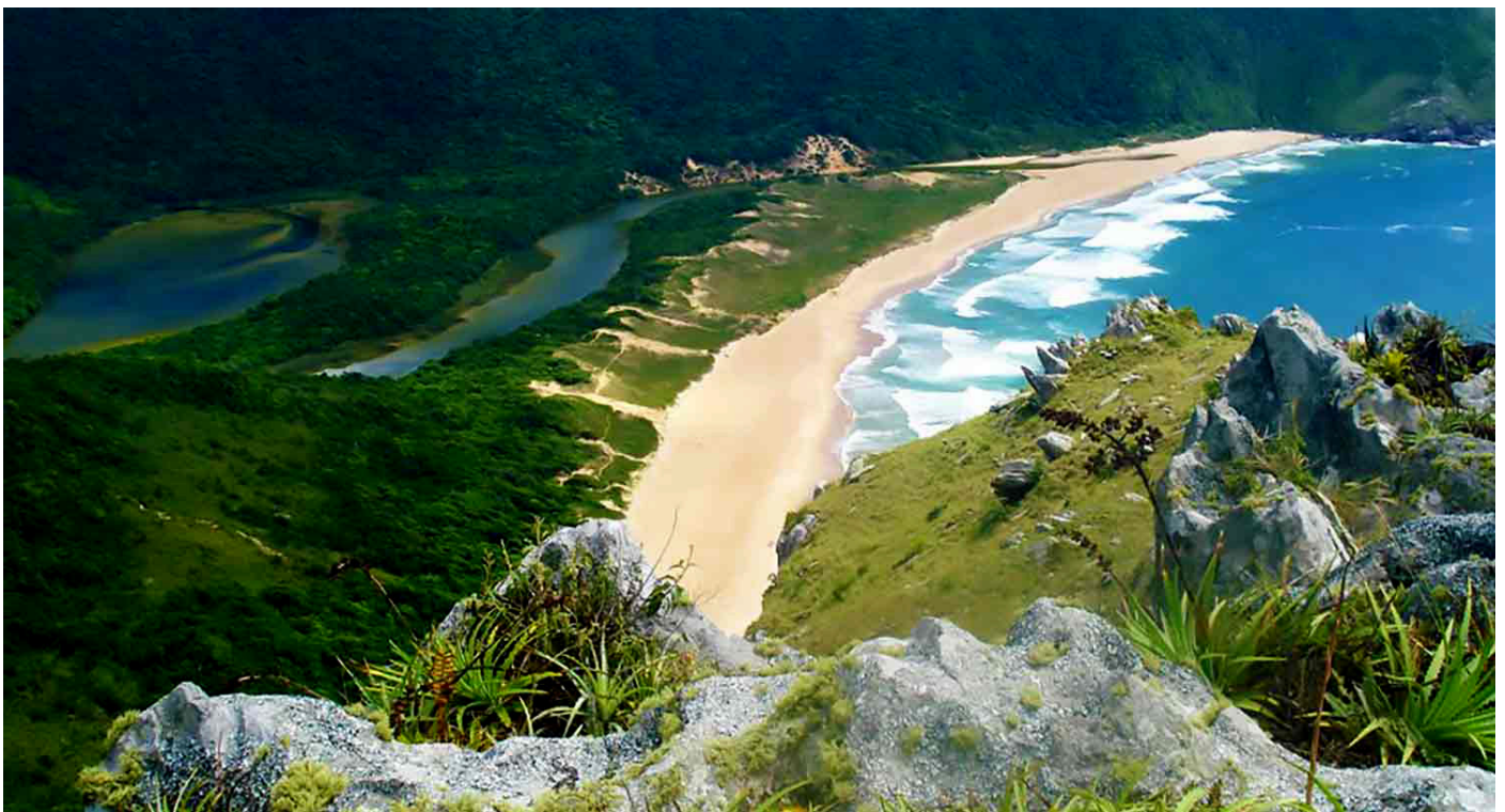
Lagoinha do Leste Beach

Florianópolis's wildest shore, this strand of soft sand is framed by imposing mountains coated in a subtropical forest. It's a trek to get here – literally. The only way in is over the mountains on a steep jungle trail running from Praia do Matadeiro beach, immediately to the north. It's a sweaty, hour-long walk and as there are no facilities at Lagoinha do Leste, you'll need to bring your own water. But you'll be so thrilled you came.